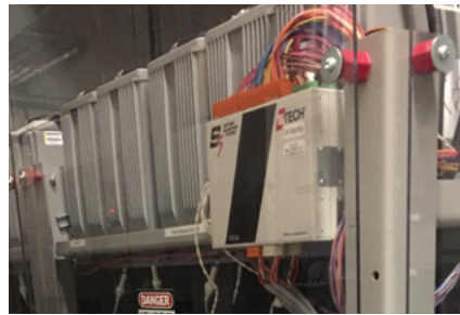
INDIVIDUAL AND LARGE-SCALE SYSTEM APPLICATIONS