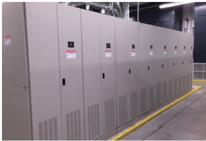
EXTENSIVE VRLA AND VLA BATTERY TYPE EXPERIENCE

As experts in battery health technology, we're always innovating our offerings to remain sustainable and shape the future of our industry.