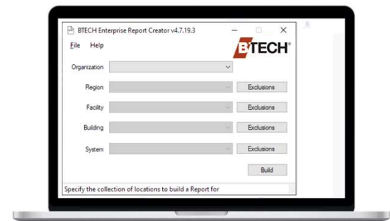
Report Creator quickly generates a complete report across a variety of data points for any or all battery systems in your organization.